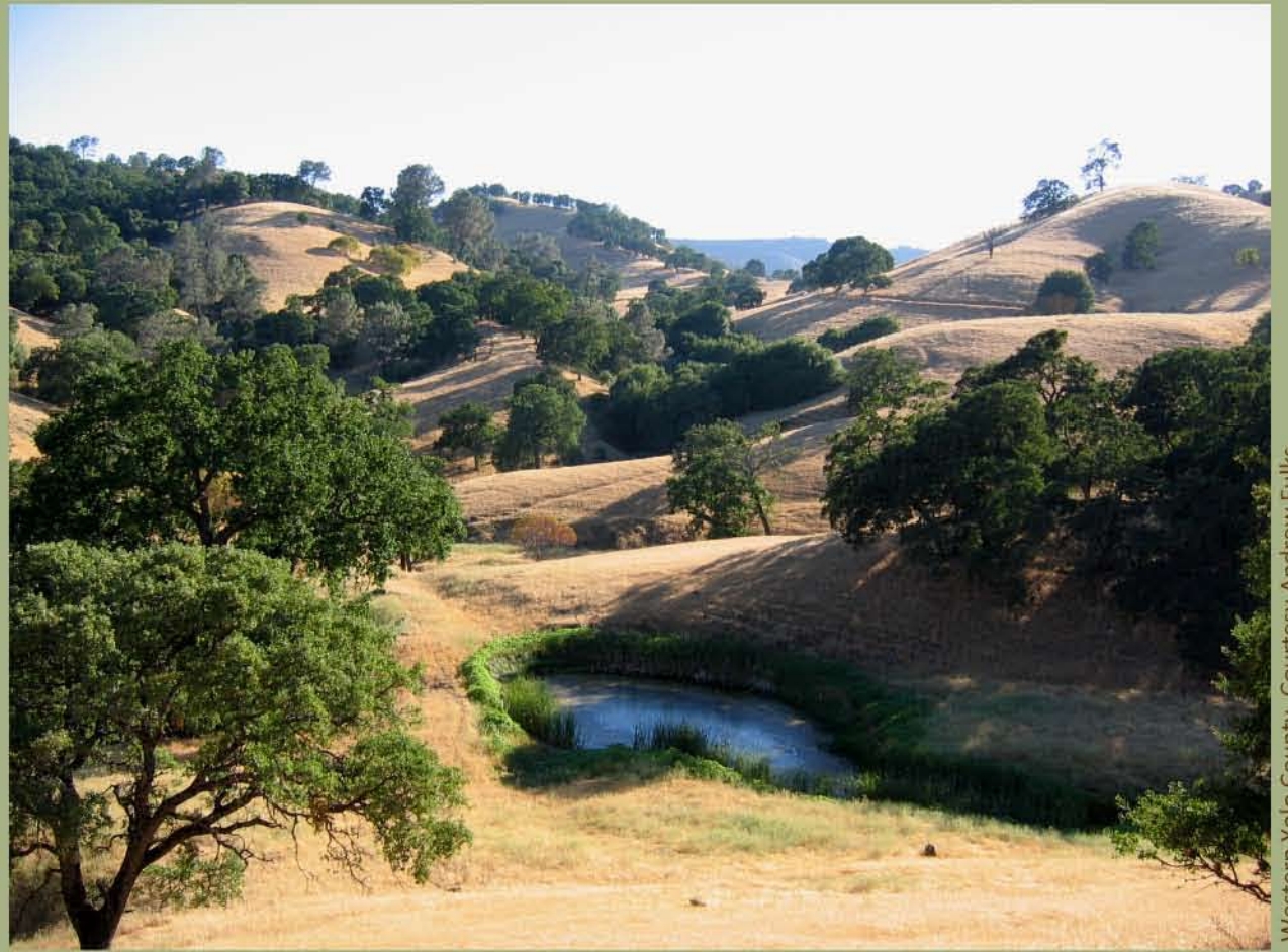
Western Yolo County.

Uninsured middle-age Americans are at higher risk of death until age 65.