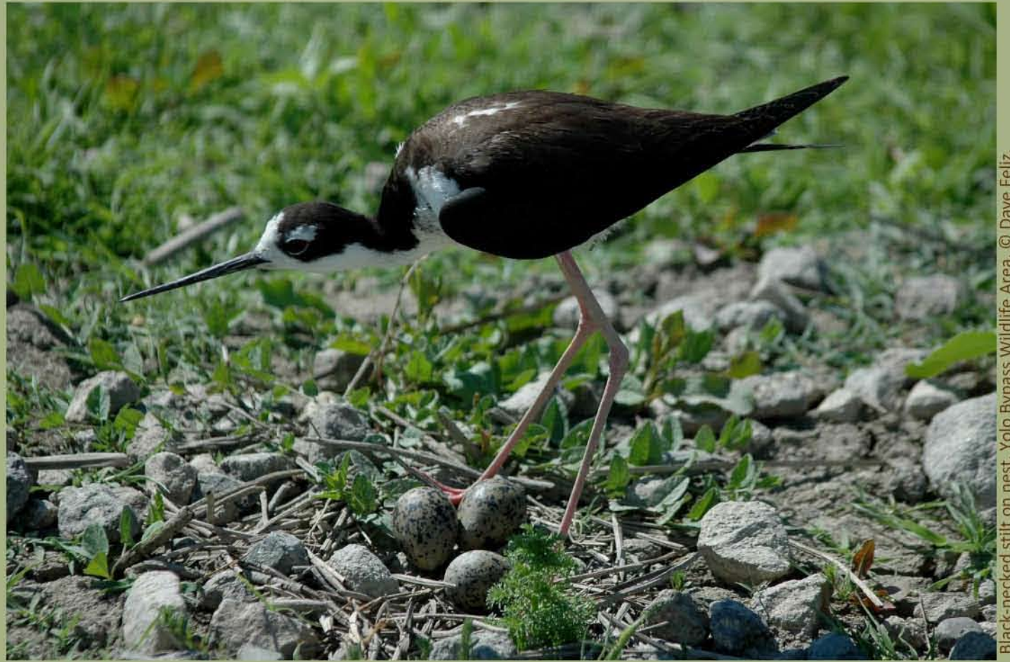
Black-necked stilt on nest, Yolo Bypass Wildlife Area.

Timely prenatal care is crucial for the health of both mother and infant.