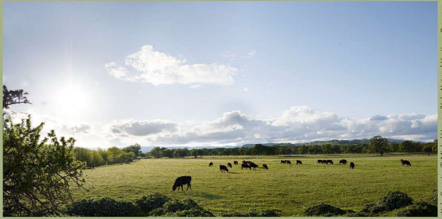
Yolo County, © Michal Venera/Yolo Natural Heritage Program.

Violence is a serious public health problem affecting all ages and socioeconomic groups. Crime statistics only tell part of the story about violence. Violence – including gang violence, intimate partner violence, sexual violence, child abuse, and elder abuse – often goes unreported. Violence is more than a traumatic experience. Research has found that adverse experiences such as sexual abuse lead to a range of emotional and health consequences for victims. Victims of adverse childhood experiences are more likely to suffer chronic diseases, experience emotional and functional disability, engage in harmful behaviors, and have difficulties in their intimate relationships. 29,30 Violence also impacts our communities and neighborhoods, taking a toll on our collective sense of security and our immediate and long-term health and welfare.