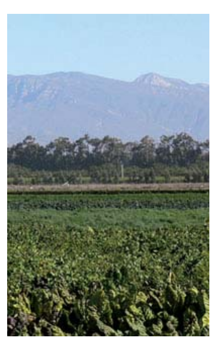
Agricultural lands on Ventura County's Oxnard Plain

Perhaps the Williamson Act must evolve, but I and many others in LAFCos believe that it should not wither.