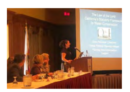
General session focused on the role of conservation in urban water supplies