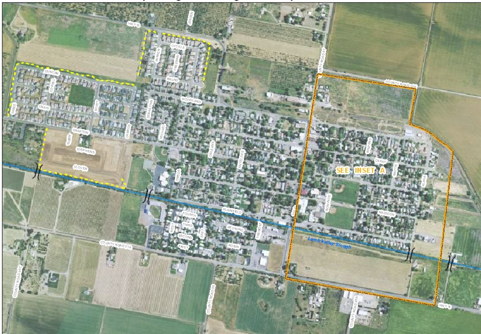
FIGURE 5 Lamb Valley Slough Crossings and Bicycle/Pedestrian Trails