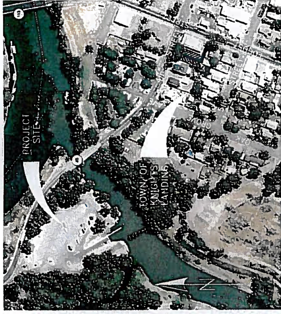
LOCATION MAP SCALE: N.T.S.