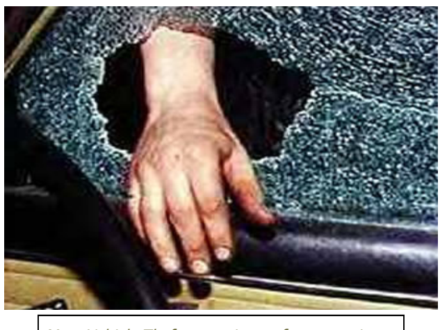
Most Vehicle Thefts are crimes of opportunity

Most Vehicle Thefts are crimes of opportunity so the harder you make it for a thief to target your car the less likely you are to become a victim. By following these easy tips it is less likely that your vehicle will be stolen: