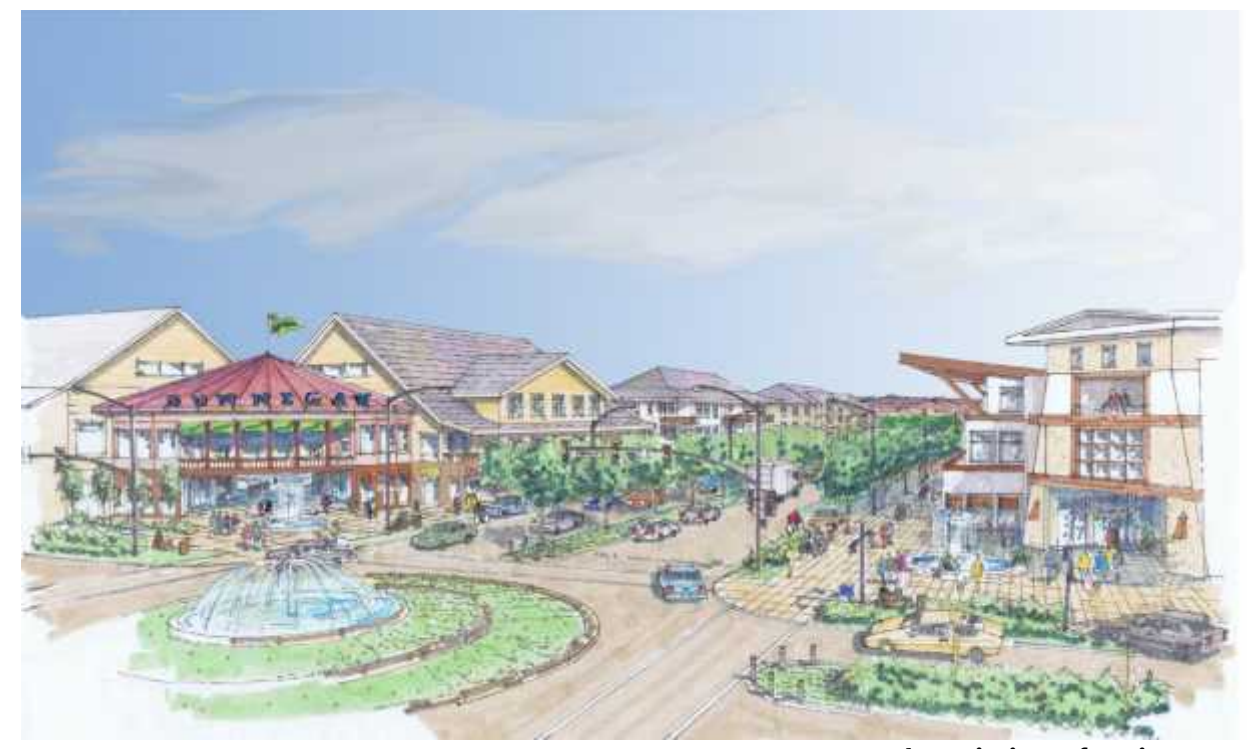
Conceptual Depiction of Main Street

The Dunnigan Town Center, located south of Road 6 along "Main" Street, is envisioned to attract a variety of neighborhood-serving retail and mixed-uses. The Town Center is located within the Dunnigan Creek District, which will be one of the primary northern gateways into Dunnigan during the early years of the community's emergence.