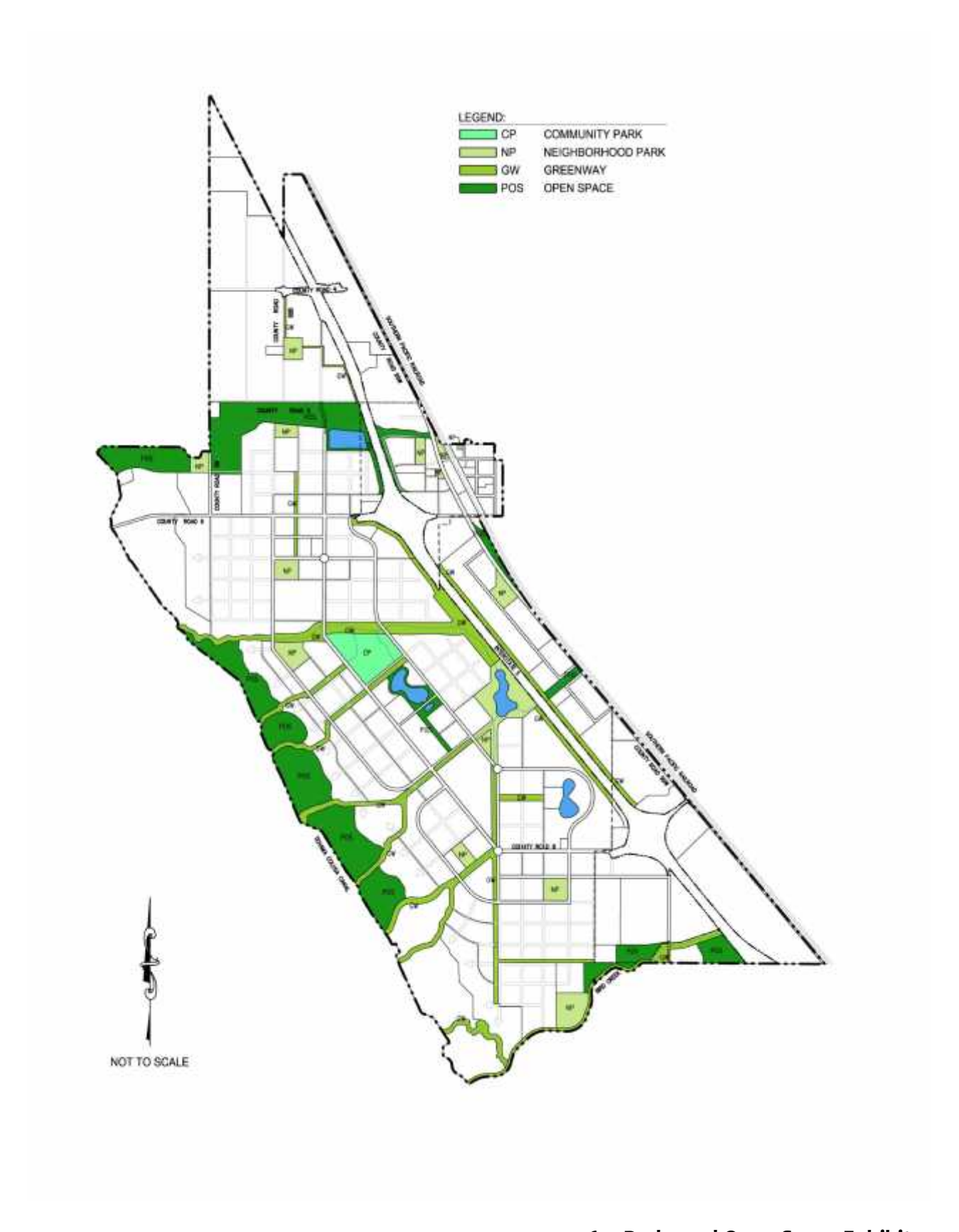
6.1: Parks and Open Space Exhibit