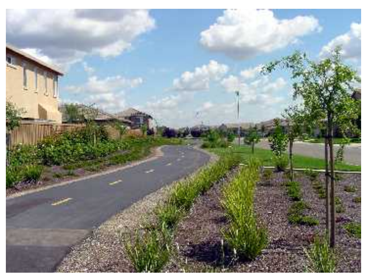
Example of Greenway Trail

Most of the greenway parcels include a pedestrian and/or bicycle circulation trail system that connects the open network, space parks, schools. commercial and employment areas to