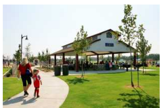
Example of Community Park amenities

The Community Park program will provide recreational opportunities and amenities to be used as the primary community recreational amenity for Dunnigan. The objective of this element is to establish a wide range of diverse amenities that provide citizens recreational opportunities with flexibility in present and future programming. Design emphasis on sustainability and creation of an outdoor space in which the community