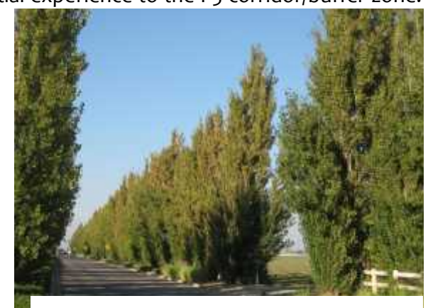
Example of hedgerow buffer

Dense hedgerow type plantings will provide protection for adjacent land uses from the highway and will soften edges to residential, office/research development, light industrial, and highway commercial land uses. The DSP Design Guidelines further define specific development requirements for the I-5 corridor/buffer.