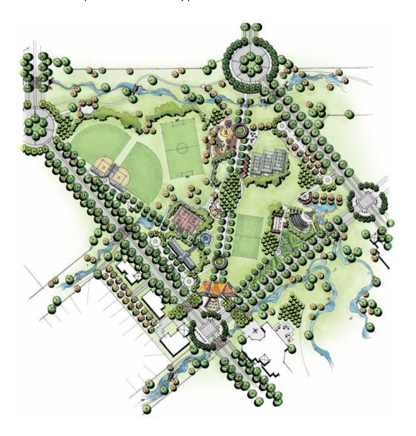
Exhibit 6.2: Illustrative Depiction of Community Park

will take ownership of is paramount. The Community Park will "stand the test of time" and be a true asset and benefit to the community. The Dunnigan Community Park will be structured to be predominantly active recreation amenities with passive elements, such as picnic areas and community gardening space, at a smaller scale. Community Park planning will be coordinated with Neighborhood Park level programming to ensure an overall cohesive recreational element. An illustrative depiction of the community park is shown below in Exhibit 6.2.