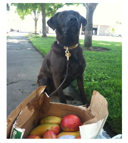
K-9 Dozer with an unmarked package of Mangoes

Dozer will scratch at parcels to alert his handler that the package contains agricultural products. The package is then inspected by a biologist to determine if the agricultural products are allowed into California.