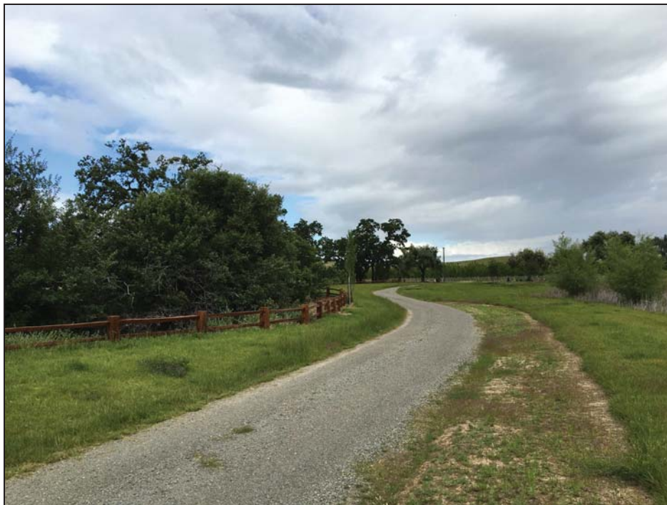
Plate 5. Looking north along gravel footpath on the west side of the 2-acre pond. Chickahominy Slough is on the left, the pond and marsh is on the right..