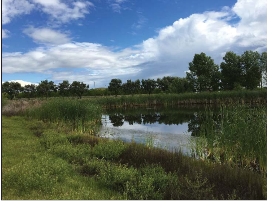
Plate 6. Looking northwest from the pier on the 2-acre pond. Cattail marsh occurs around the perimeter in foreground and background. County Road 29 is adjacent to the row of olive trees in the background that border the road on the south side.

The area south of Chickahominy Slough is open pasture that has historically been used for livestock grazing and may have been cultivated at one time. It consists primarily of a naturalized annual grasses typical of the interior Coast Ranges and a variety of introduced pasture grasses and legumes (Plates 7 and 8). There are no structures on this portion of the property. A small stock pond is present on a higher terrace near the southern border and patches of oak woodland are present in the higher elevation areas on the southern edge of the property (Plate 9). The pasture on the eastern end of the property, south of Chickahominy Slough and just southeast of the main house includes a large area that was excavated several years ago and that appears to flood periodically. The extent and duration of inundation is undetermined as are its functional hydrology and wetland status. This site likely provides additional wildlife value for species attracted to shallow ponded habitats.