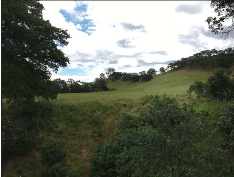
Plate 9. Looking southeast from Chickahominy slough across the pasture to oak woodland on the higher elevation southern boundary of the property.