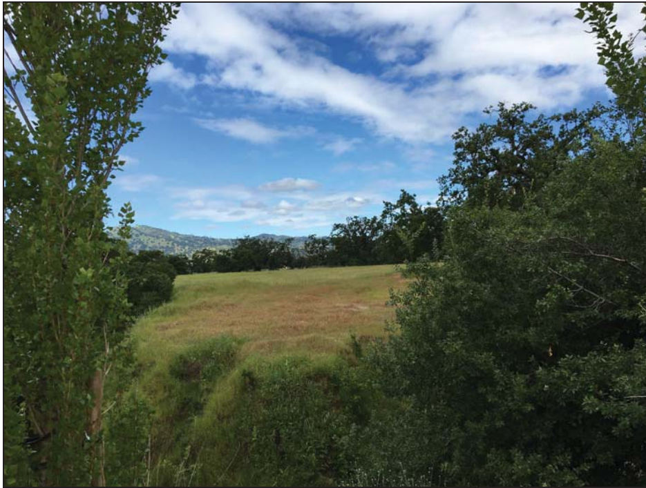
Plate 1. Looking west from just west of 2-acre pond, through Chickahominy Slough with the slough also in the background as it meanders through the western portion of the property.

long-term farming/ranching operations and, other than the slough itself and the emergent marsh associated with the 2-acre pond, does not retain significant natural features (Plate 3 and □). The area in the immediate vicinity of the main house, the second nearby house, and barns is landscaped with lawns and mature native and nonnative trees and shrubs and is subject to regular and typical human activities and disturbances. While the open grass area east of the main house is mostly weedy, unused, and maintained through periodic mowing, the area west of the main house in the vicinity of the 2-acre pond is more landscaped and includes rail fences, graveled footpaths, and lawns (Plate 5). The 2-acre pond, which is near the western edge of the homestead area west of the main house, is mostly open water and includes a small wooden pier on the southern end that extends approximately □0 feet into the pond. Emergent marsh, dominated by dense cattail ( Typha spp.), extends around the perimeter of the 2-acre pond on the south, west, and north sides with the largest patch occurring on the northwest corner of the pond (Plate 6).