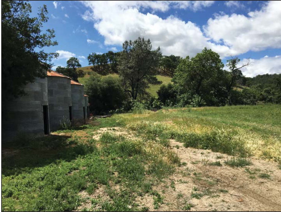
Plate 4. Looking south from near County Road 29 on the eastern end of the property. The unused silos are on the left, Chickahominy Slough behind the silos, and oak woodland on the hill top in the background.