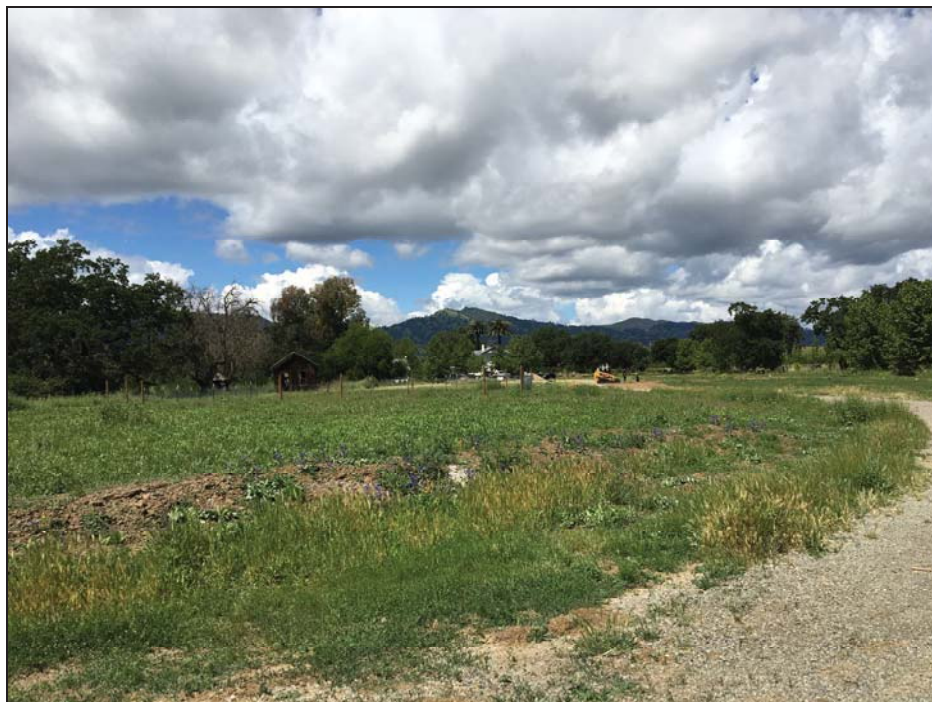
Plate 3. Looking west from the eastern portion of the property. Chickahominy slough is on the left, the main house is in the center background, and County Road 29 is out of view on the right. The gravel road on the right is one of two graveled entrance roads to the main house. This is the proposed location of the cabins, pool and cabana, and garden.