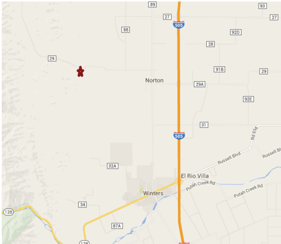
Figure 1 Vicinity Map