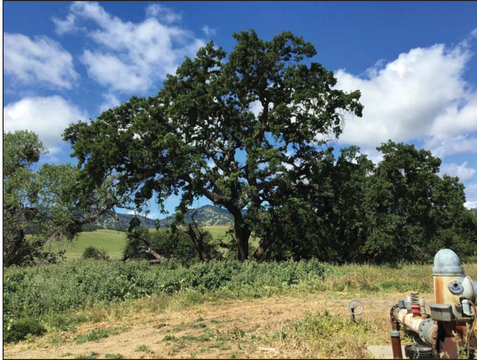
Plate 2. Typical valley oak-dominated riparian vegetation along Chickahominy Slough. Looking southwest from near the northwest corner of the property.