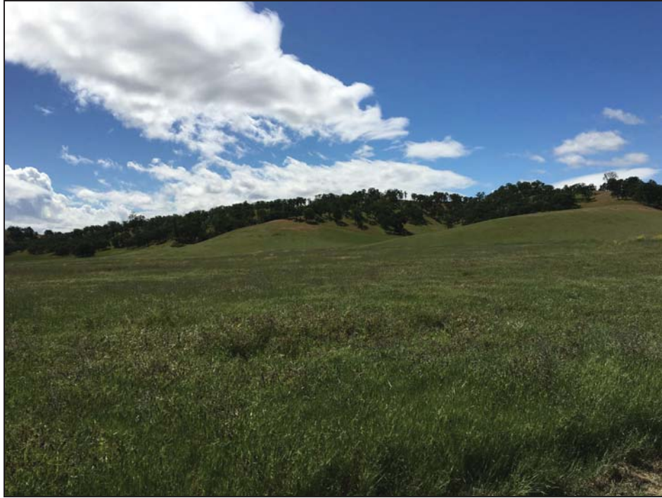
Plate 7. Looking southeast toward pastureland south of Chickahominy Slough. The property line is near the tree-lined ridge in the background.