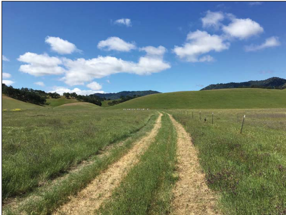
Plate 8. Looking south along the western property boundary.