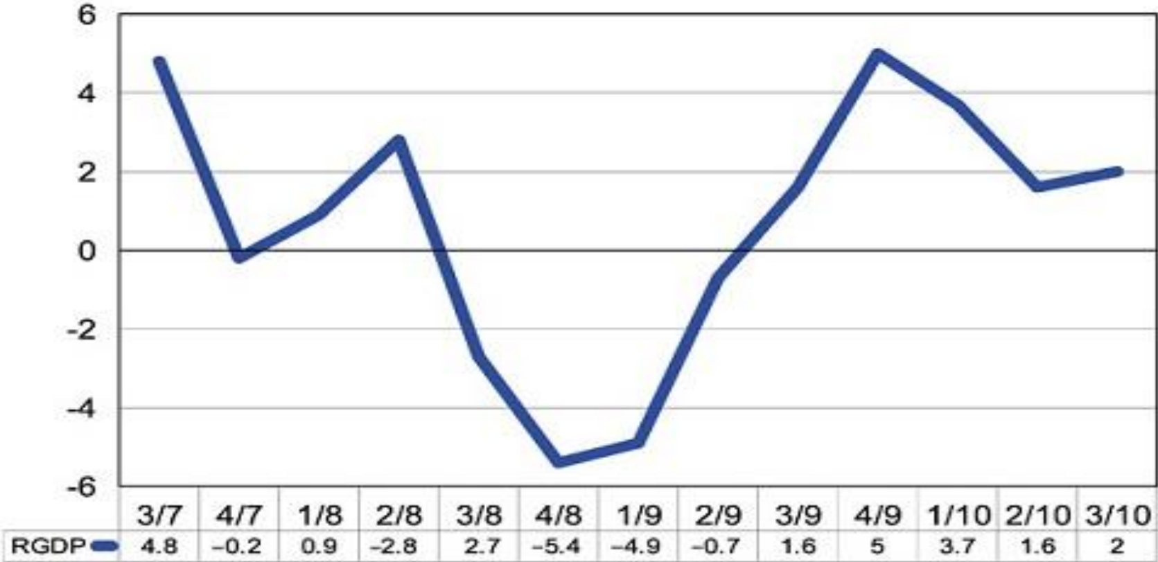
Annual RGDP change by quarter