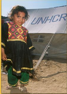
1 Individual Referrals