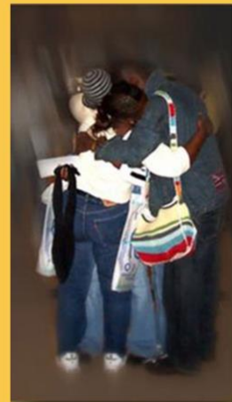
3rd Country Resettlement