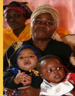
3 Family Reunification