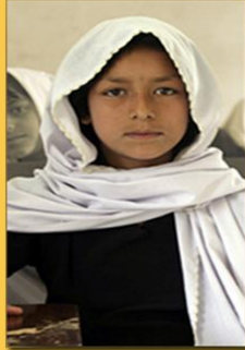
2 Group Referrals