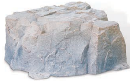
NA0335P03 RIVER BED 34"L x 32"W x 15"H (COVERS LIDS UP TO 13" ABOVE GRADE)