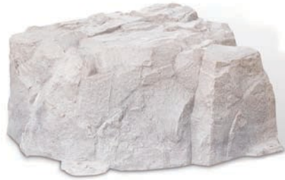
NA0335P02 FIELD STONE 34"L x 32"W x 15"H (COVERS LIDS UP TO 13" ABOVE GRADE)