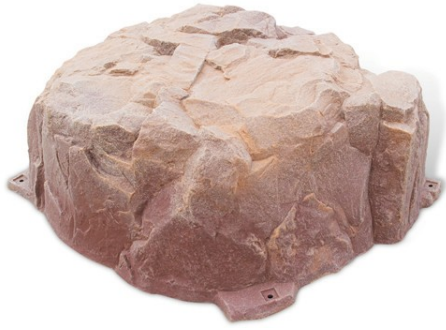
NA0335P01 AUTUMN BLUFF 34"L x 32"W x 15"H (COVERS LIDS UP TO 13" ABOVE GRADE)