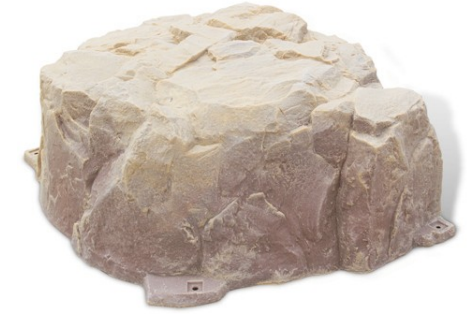
NA0335P04 SAND STONE 34"L x 32"W x 15"H (COVERS LIDS UP TO 13" ABOVE GRADE)