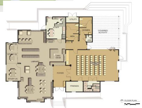
Top: Photo of existing library (MIG, 2017); Middle: NOP Figure 3; Bottom: NOP Figure 4