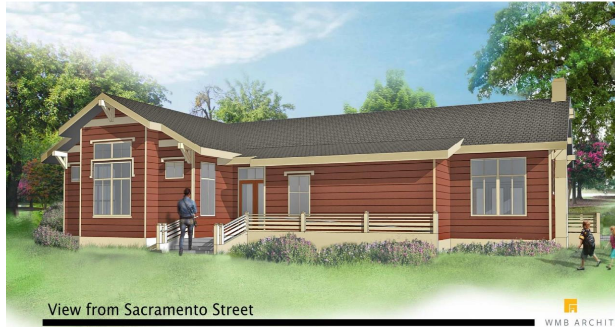
Figure 4 from November 13, 2017 NOP