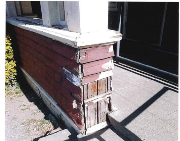
Excerpts from 2016 Buehler and Buehler Structural Review