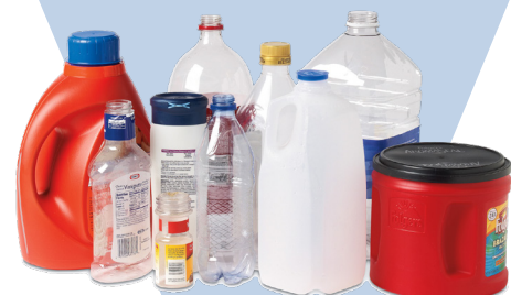
Empty Plastic Bottles & Containers

No plastic bags. Please do not bag recyclables, keep loose.