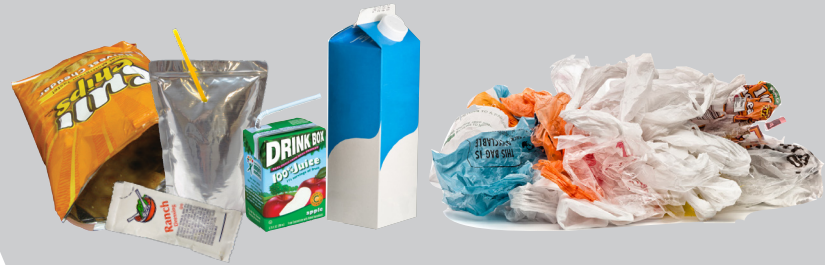
Snack & Chip Bags, Drink Pouches & Boxes, Wrappers, Plastic Wrap, Bags & Other Film Plastic