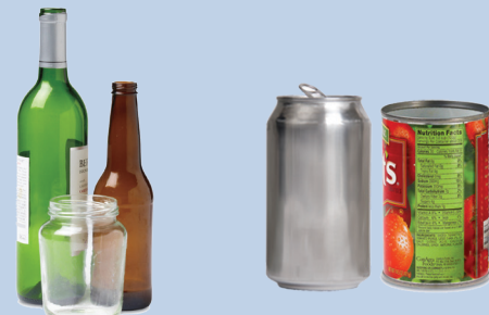
Empty Glass Bottles & Jars, All Metal Beverage & Food Cans