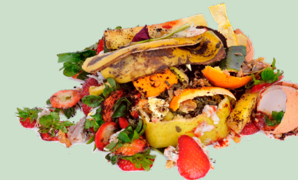
Food Scraps, Including Egg Shells, Meat & Bones