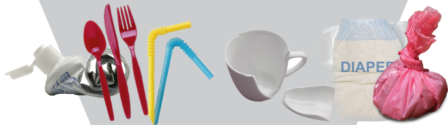
Plastic Utensils, Plastic Straws Broken Glass & Dishes Diapers & Pet Waste