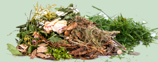
Grass, Weeds, Plants, Tree Limbs, Wood Chips, Dead Plants, Brush, Garden Trimmings, Leaves, Cut Flowers (Please place palm fronds, yucca and cacti in the Trash)