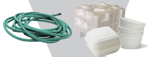
Hoses, Cords & Wire, Polystyrene Foam & Packaging