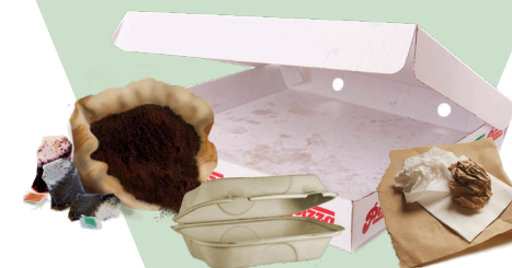
Pizza Boxes & Food-Soiled Paper, Napkins, Paper Towels, Coffee Grounds, Tea Bags