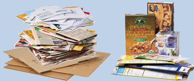
Clean Paper, Magazines, Newspaper, Junk Mail, Cardboard, Cardboard Egg Cartons, Cereal Boxes