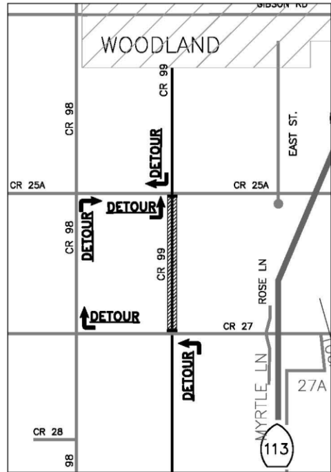
CR 99 CLOSURE FROM CR 27 TO CR 25A