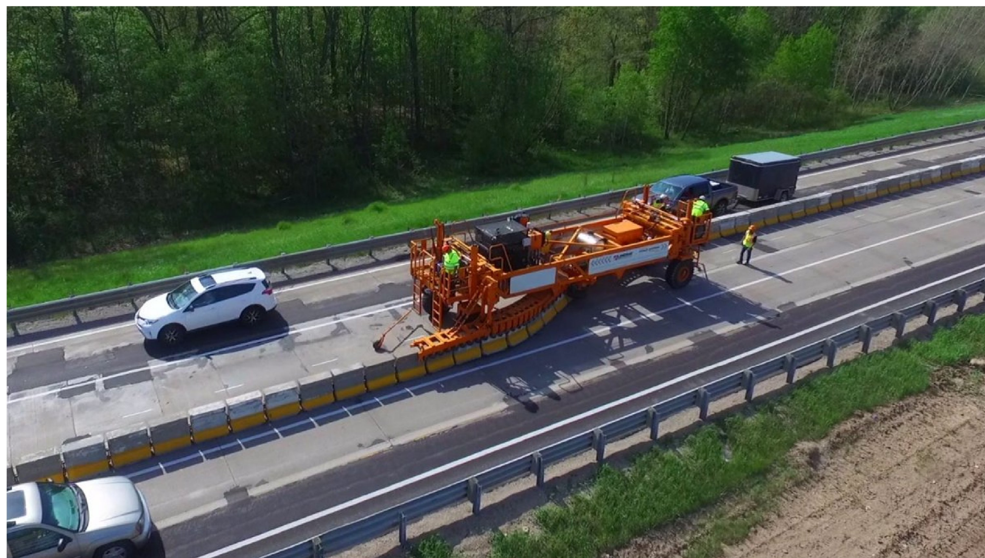
BARRIER SYSTEM FOR REVERSIBLE LANE