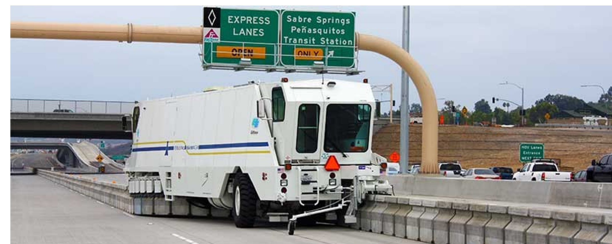
BARRIER SYSTEM FOR REVERSIBLE LANE