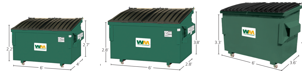
1 Cubic Yard Container* Recycling, Organics 2 Cubic Yard Container* Recycling, Organics 3 Cubic Yard Container* Recycling, Organics