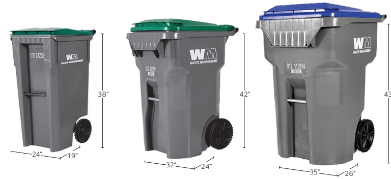
35-Gallon Cart Organics (green lid) 64-Gallon Cart Organics (green lid) 96-Gallon Cart Trash (grey lid) Recycling (blue lid)