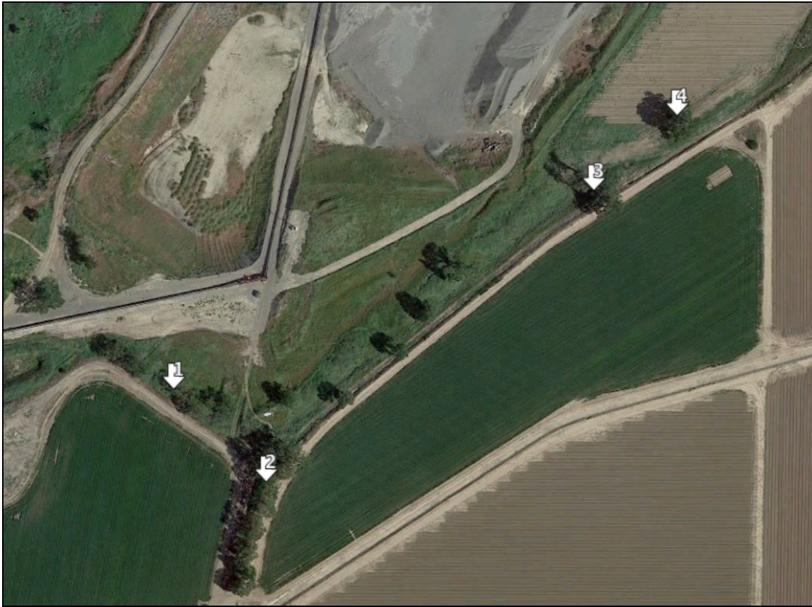
Figure 2. Location of four trees possessing crevices or exfoliating bark suitable for use as bat roosts for crevice dwelling bat species.