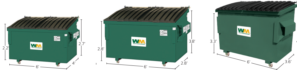
1 Cubic Yard Container* Recycling, Organics