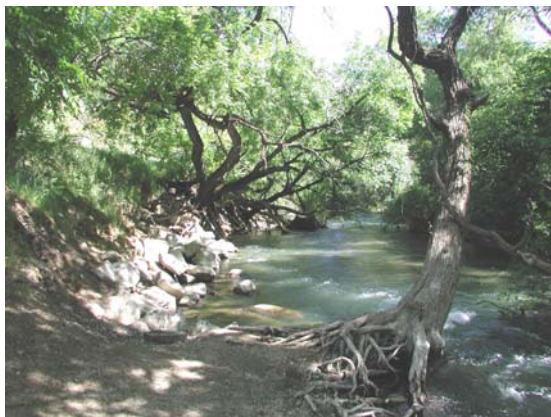
Putah Creek Access Sites: "And if you get lost come on home to Green River...."

Collectively, the habitat in these park units is continuous in all directions with similar habitat types throughout. The site is also wildlife-rich. For example, this area is foraging territory of the pileated woodpecker, one of the largest of the remaining American woodpecker species. The south side of the creek is less disturbed and thus more valuable environmentally.