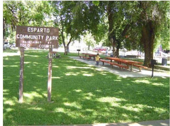
Esparto Community Park.

Esparto Community Park functions as a town commons, visual center, and gathering place for family and community events in Esparto. Esparto Community Park is also the venue for the Capay Almond Festival, and it serves as a place for information displays and event activities. A portion of the park is used for the Esparto Farmers Market under an agreement between the County and Capay Valley Vision. The park is also a popular site for family and community parties and gatherings. This park receives considerable daily use and serves important functions in maintaining community cohesiveness and identity.