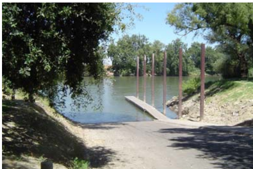
Boat launch area at Elkhorn Regional Park.

This remnant floodplain and other lands within the park are vegetated with very large riparian tree species, including a number of California sycamores greater than 30 meters tall and many large Fremont cottonwoods and valley oaks. The overstory canopy is generally not fully closed, and there is generally a lower tree stratum of willows, black walnut trees, box elders, and other species. The