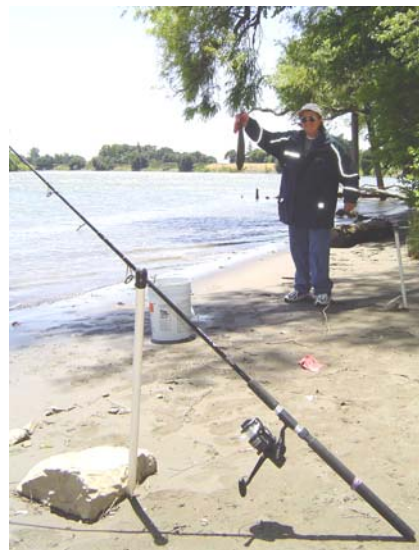
Fishing from the shore and from boats are both popular activities at Clarksburg River Access & Boat Launch.

This site is an intensively used boat access and river-fishing facility. The levee slope and the terrace surface provide limited habitat value. The structure of the existing valley foothill riparian habitat at this site has been reduced and simplified to a narrow longitudinal corridor, often little more than one tree wide, near the water's edge for most of the site.