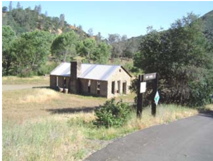
Old stone cabin at Camp Haswell Park.