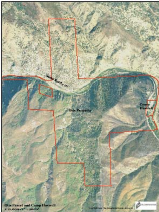
This plan recommends treating Camp Haswell Park (small area on right) and Otis Ranch Open Space Area (larger boundary) as a combined and integrated facility for management purposes.

The Otis Ranch Open Space Park property shares many of the ecological values identified previously for the Cache Creek Canyon Park. However, the Otis property covers a greater elevation range than occurs in the Cache Creek Canyon Park, potentially increasing the range of habitats present. The large size of this property and the linkage that it provides to natural habitats on public lands both north and south of Cache Creek enhances its environmental resource value.