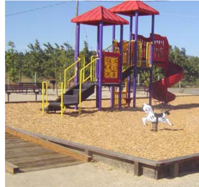
Play equipment in the center of Dunnigan Community Park.

park includes a perimeter fence and drip irrigation system.