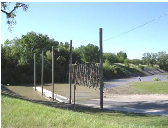
Knights Landing Boat Launch is located on a slough that flows into the Sacramento River.

The main improvements at this site are the boat ramp and adjoining parking area. The parking area provides spaces for approximately 28 cars with trailers and 15