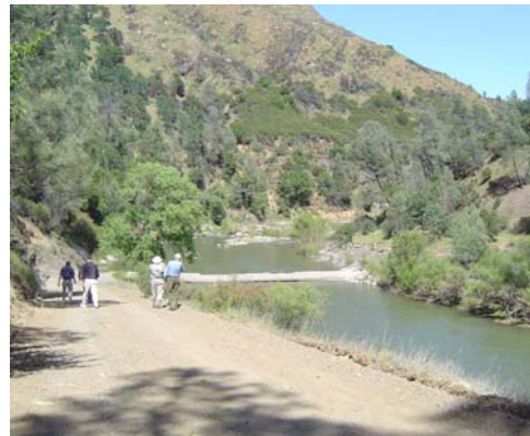
Low-water access at Cache Creek Canyon Regional Park.