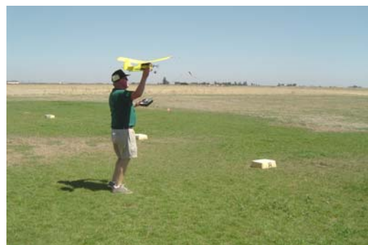
Model plane flying at Grasslands Regional Park.

Grasslands Park provides a regional venue for a variety of specialty recreational uses, including archery, remote-controlled model sail plane and electric glider flying, and horseshoe pitching. Archery activities are conducted under a lease agreement between the County and the Yolo County Bowmen Archery Club, which has held leases at the site since 1979. The lease agreement applies to a 40-acre archery target area plus a 100-yard buffer on three sides, for a total area of approximately 58 acres. A portion of the Archery Club’s area is used by the Yolo County