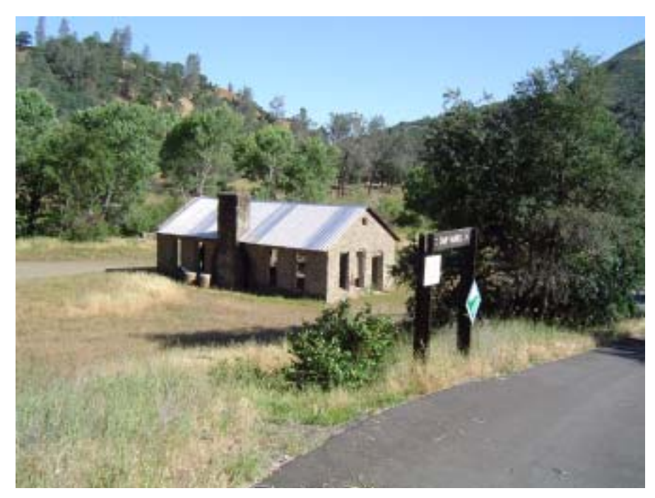
The old stone cabin at Camp Haswell should be restored, if feasible, as part of a change toward multiple use management at this scenic park site.

A potential opportunity exits here with the proximity of Camp Haswell to the Otis Ranch property. The County should investigate and, if feasible, develop, in conjunction with interested parties, a foot trail linking Camp Haswell and the Otis Property (1). A modest trailhead facility could be developed in conjunction with trail access to the Otis Property from this location. User and trail information could be provided at the trailhead (and the information center). The plan mentioned above could including parking for those using the Otis Property (5).