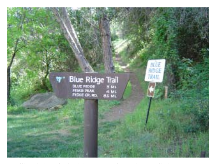
Trailhead signs invite hikers to explore other public land, through the "Gateway" of Cache Creek Regional Park.