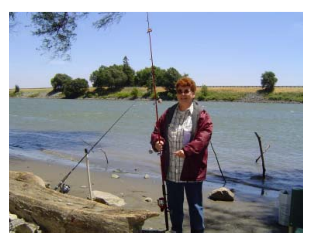
Fishing – both from boats as well as from shore – is a popular activity at the Clarksburg Boat Launch facility.