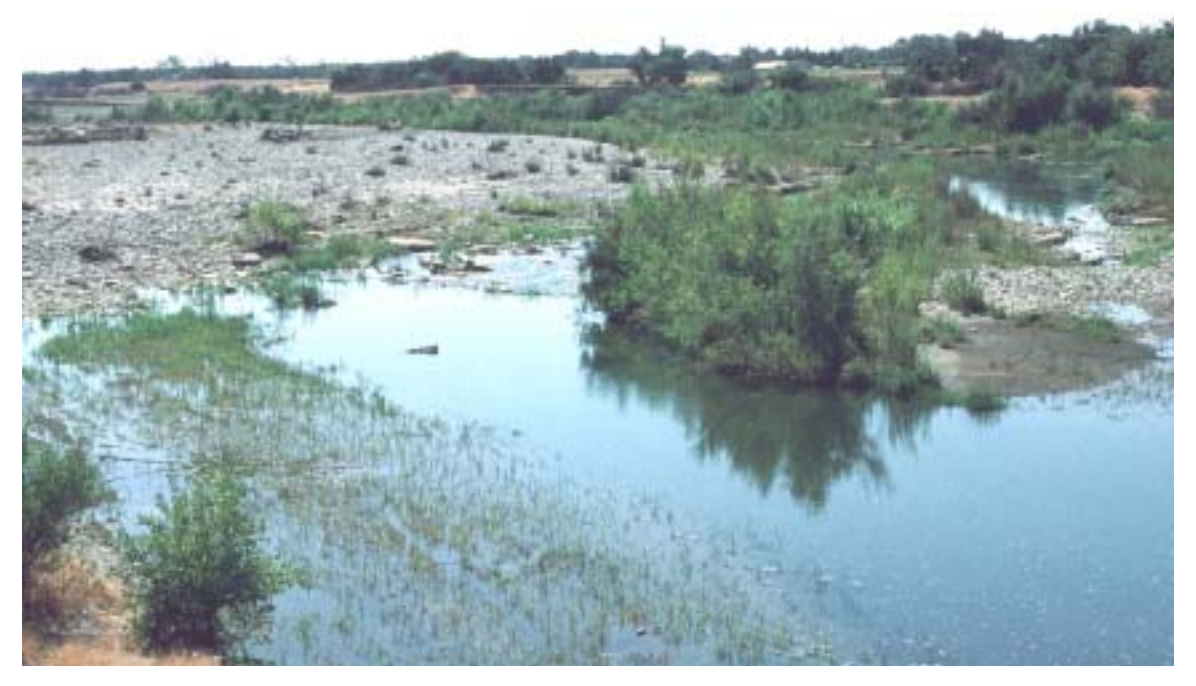
This view of a gravel bar within Capay Open Space Park shows the results of exotic species removal and re-contouring.

In terms of priorities the habitat restoration should occur prior to the development of extensive day use facilities. This will help with the establishment of viable habitat areas as well as providing a more attractive and inviting setting for day use activities at that future time. There are nearby lands that, if acquired, could accommodate additional habitat value and a more immediately useable area for day use activities.