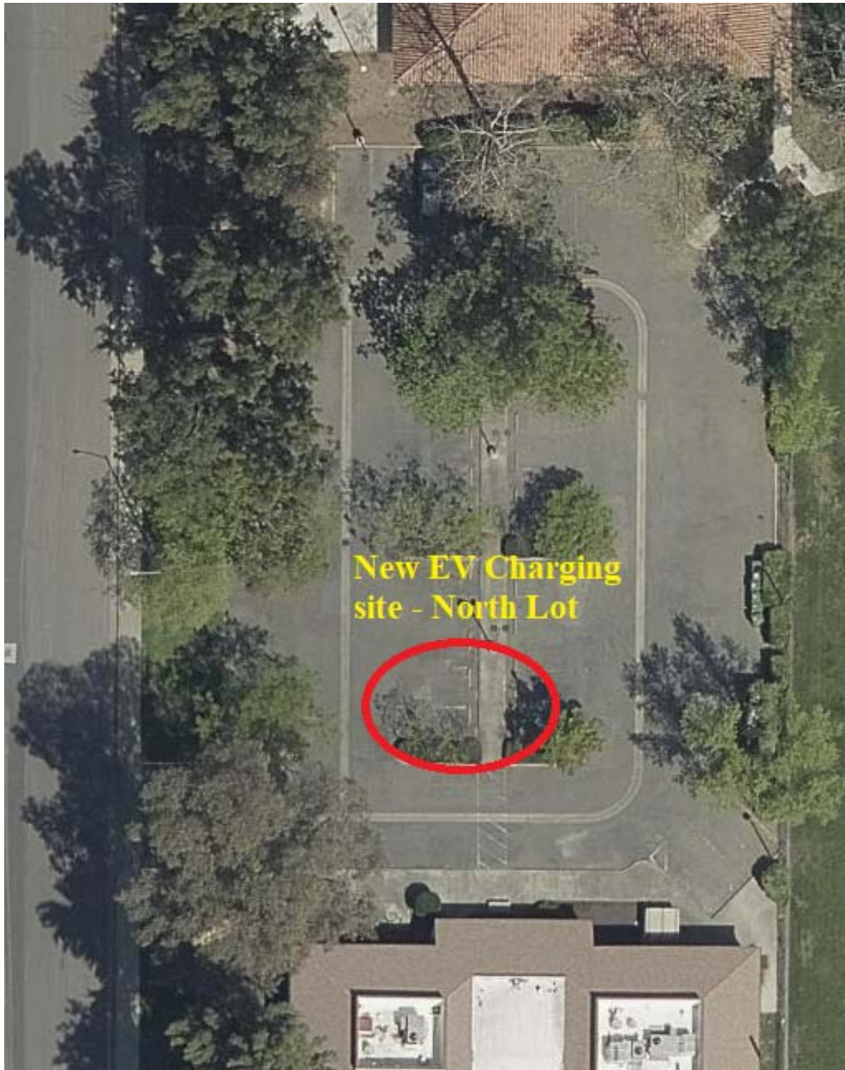
Image 2. Proposed location for EV Charging Station in the north parking lot. Site would be fully under County Control.