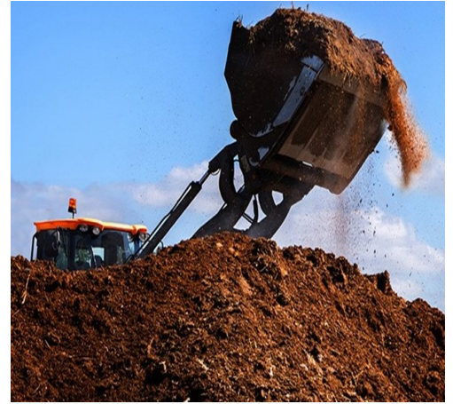
COMPOSTING FEATURED IN WASTE MAGAZINE