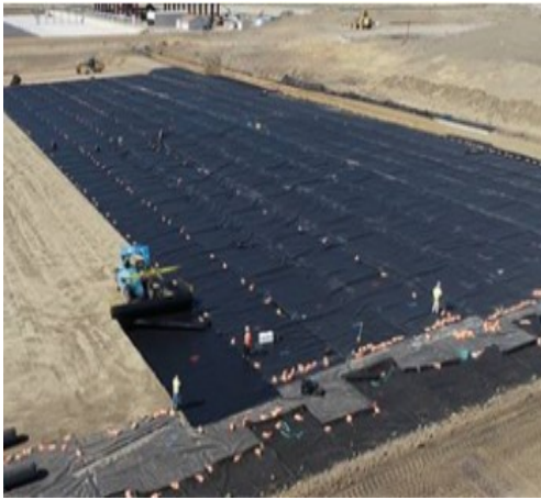
LANDFILL BIOGAS PROJECT