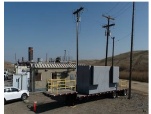
Renewable Electricity Generation