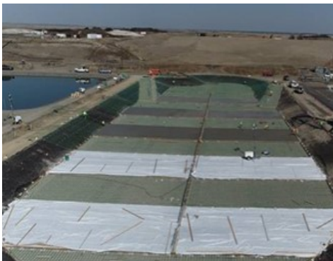
Liquid Waste Pond Reconstruction

Possession of a valid license of registration as a civil engineer issued by the California State Board for Professional Engineers, Land Surveyors, and Geologists is desired for this position but NOT required.