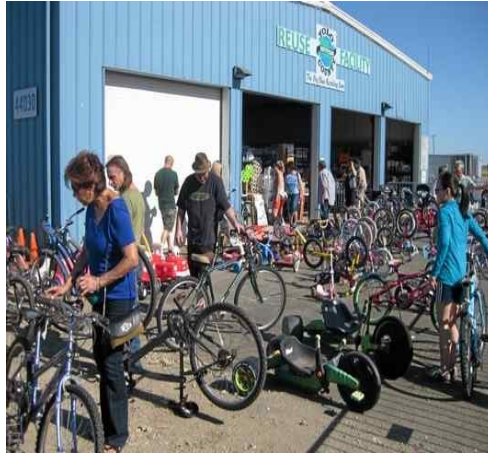
BIG BLUE BARN RECYCLING