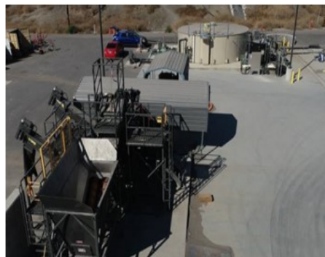
Food Waste Receiving In-Vessel Digester