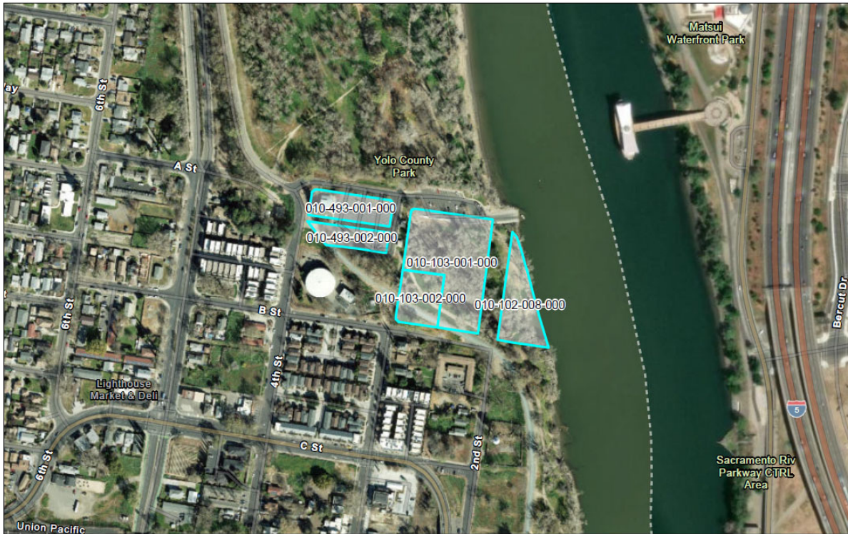
Exhibit A - Broderick Boat Ramp Parcels