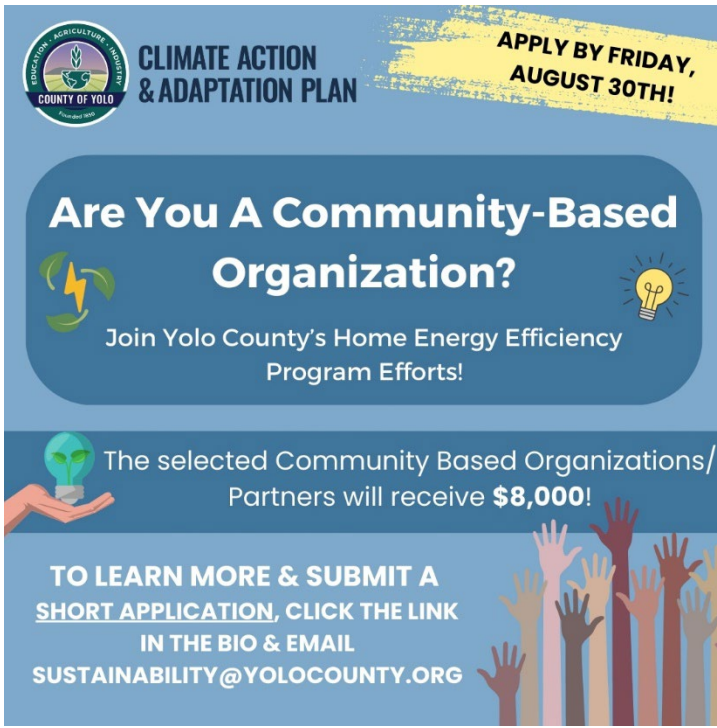
1 – Cover Page