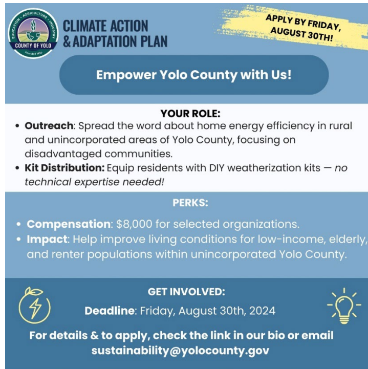
3 – Final Page