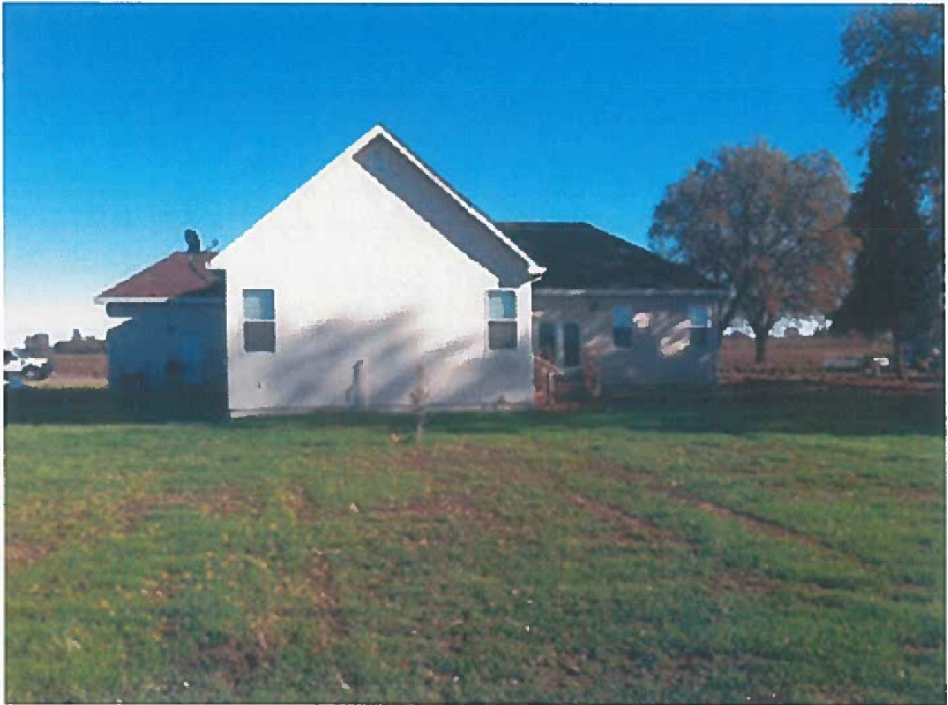
REAR VIEW (TAKEN 12/14/2015)

If submitting more photographs than will fit on the preceding page, affix the additional photographs below. Identify all photographs with: date taken; "Front View" and "Rear View"; and, if required, "Right Side View" and "Left Side View." When applicable, photographs must show the foundation with representative examples of the flood openings or vents, as indicated in Section A8.