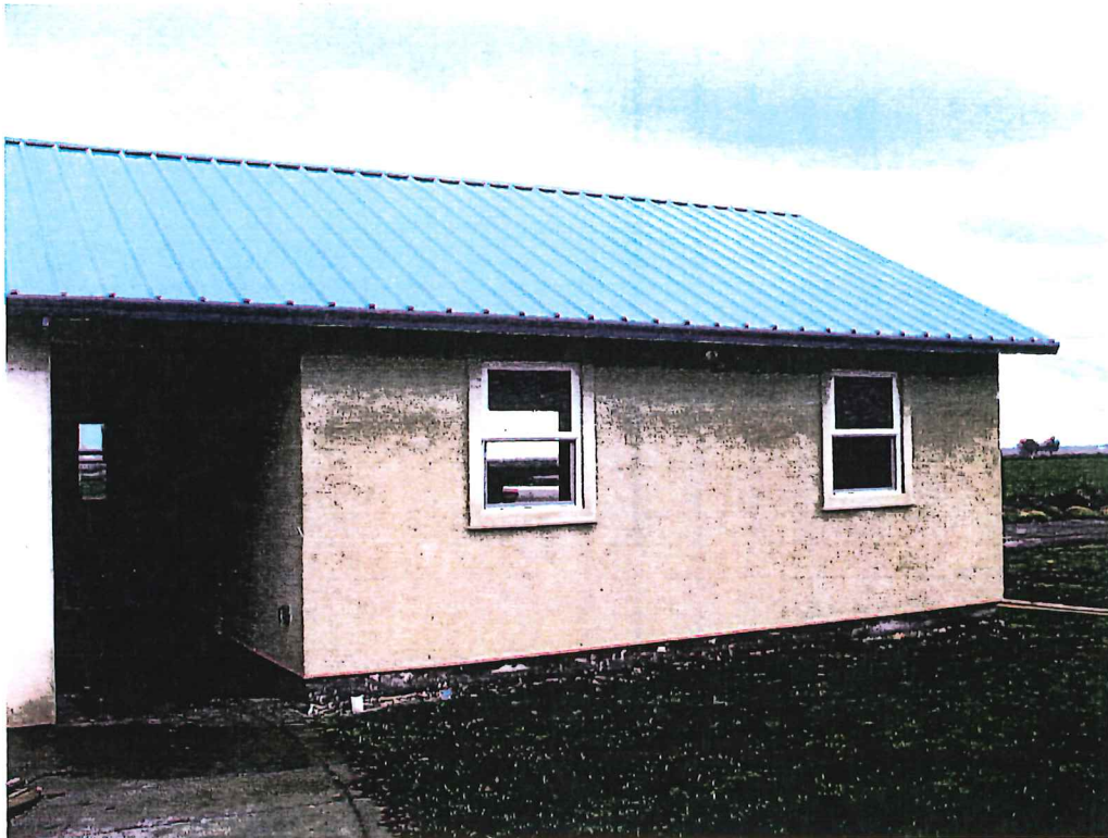
REAR VIEW 02/09/2009

If submitting more photographs than will fit on the preceding page, affix the additional photographs below. Identify all photographs with: date taken; "Front View" and "Rear View"; and, if required, "Right Side View" and "Left Side View."