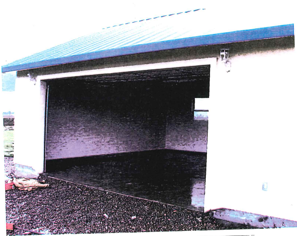
FRONT VIEW 02/09/2009

If using the Elevation Certificate to obtain NFIP flood insurance, affix at least two building photographs below according to the instructions for Item A6. Identify all photographs with: date taken; "Front View" and "Rear View"; and, if required, "Right Side View" and "Left Side View." If submitting more photographs than will fit on this page, use the Continuation Page, following.