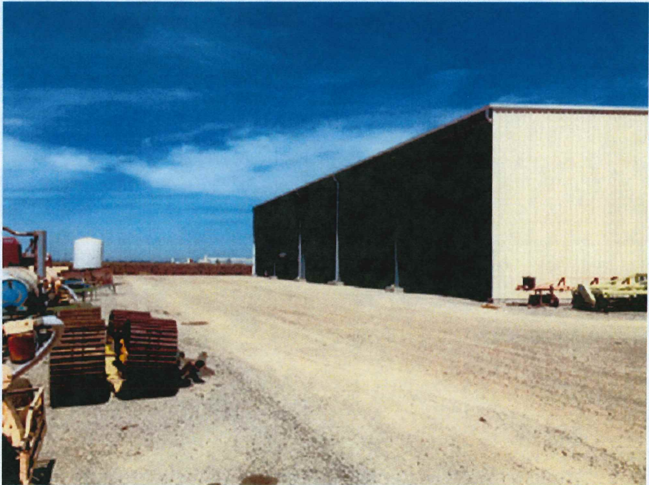
EAST SIDE VIEW (TAKEN 08/27/2015)

If submitting more photographs than will fit on the preceding page, affix the additional photographs below. Identify all photographs with: date taken; "Front View" and "Rear View"; and, if required, "Right Side View" and "Left Side View." When applicable, photographs must show the foundation with representative examples of the flood openings or vents, as indicated in Section A8.