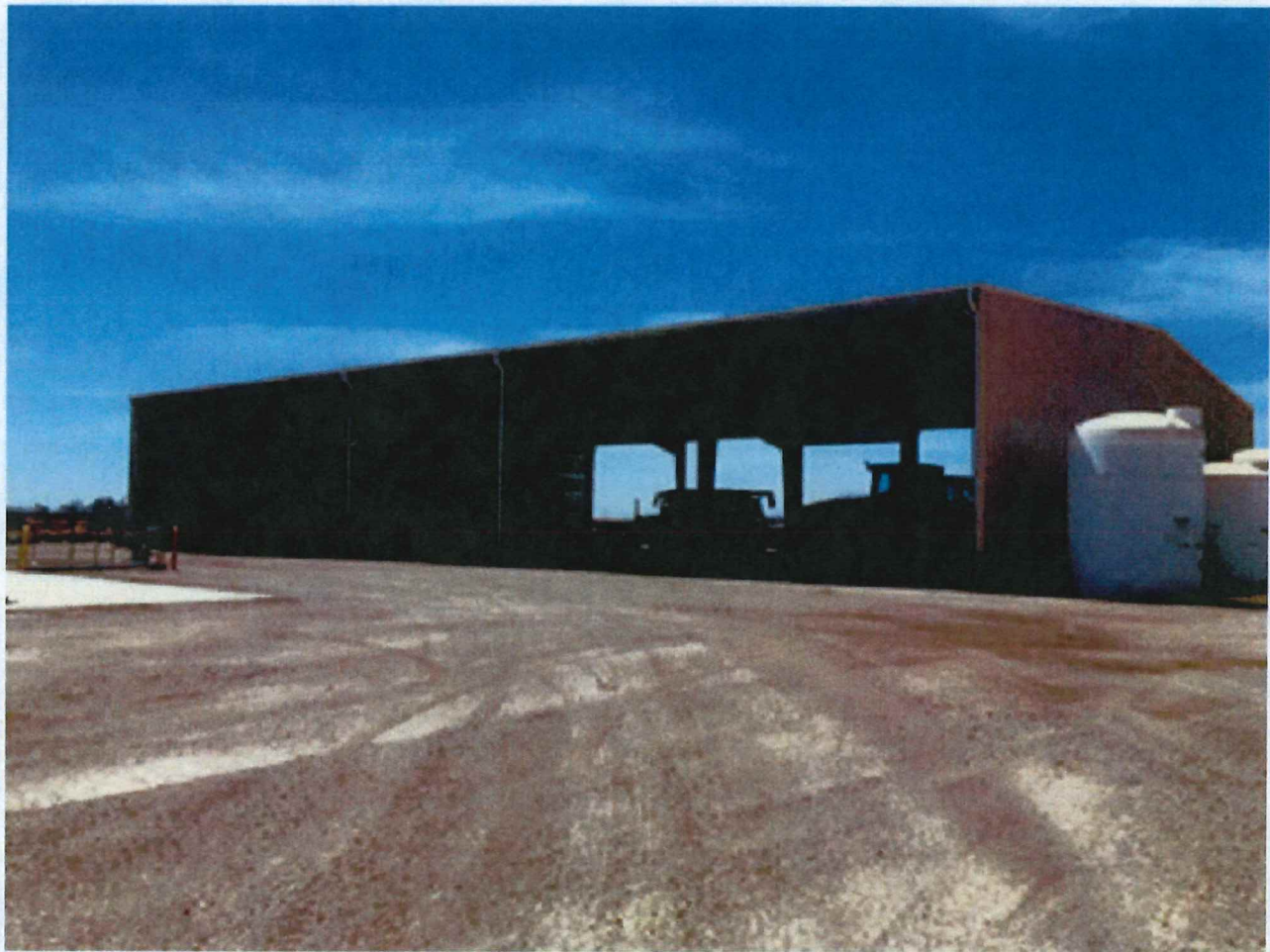
WEST SIDE VIEW (TAKEN 08/27/2015)

If using the Elevation Certificate to obtain NFIP flood insurance, affix at least 2 building photographs below according to the instructions for Item A6. Identify all photographs with date taken; "Front View" and "Rear View"; and, if required, "Right Side View" and "Left Side View." When applicable, photographs must show the foundation with representative examples of the flood openings or vents, as indicated in Section A8. If submitting more photographs than will fit on this page, use the Continuation Page.