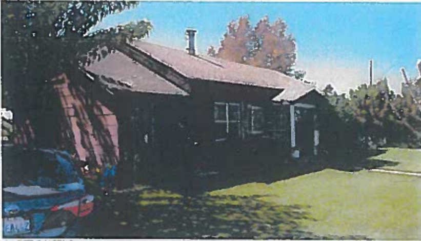
Front View 09/18/16

If using the Elevation Certificate to obtain NFIP flood insurance, affix at least 2 building photographs below according to the instructions for Item A6. Identify all photographs with date taken, "Front view" and "Rear view", and, if required, "Right Side View" and "Left Side View." When applicable, photographs must show the foundation with representative examples of the flood openings or vents, as indicated in Section A8. If submitting more photographs than will fit on this page, use the Continuation Page.