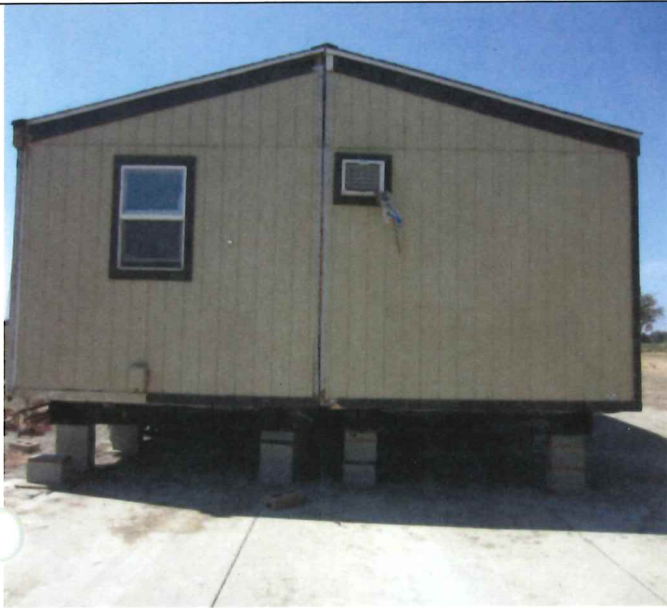
Photo East side Manufactured Home

If using the Elevation Certificate to obtain NFIP flood insurance, affix at least 2 building photographs below according to the instructions for Item A6. Identify all photographs with date taken; "Front View" and "Rear View"; and, if required, "Right Side View" and "Left Side View." When applicable, photographs must show the foundation with representative examples of the flood openings or vents, as indicated in Section A8. If submitting more photographs than will fit on this page, use the Continuation Page.