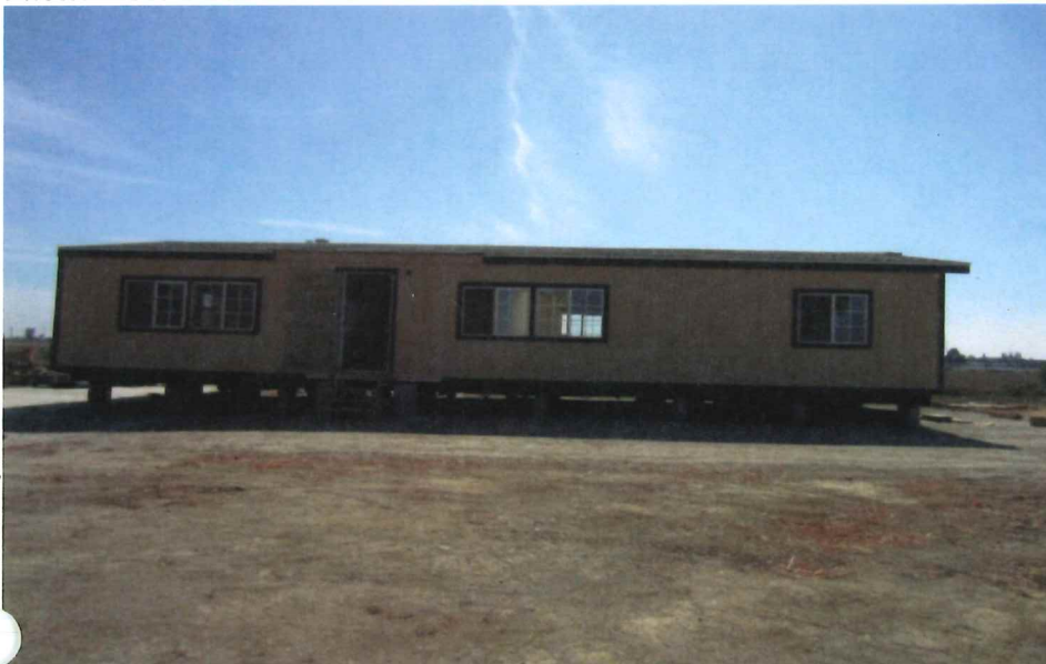
Photo: North side Manufactured Home