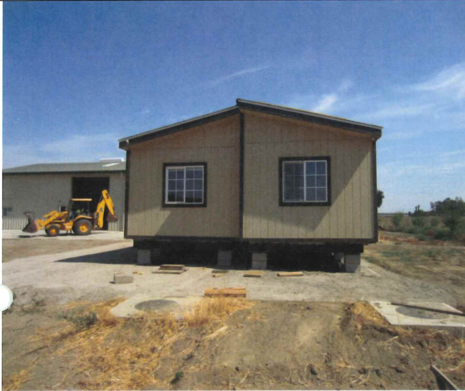
Photo: West side Manufactured Home

If submitting more photographs than will fit on the preceding page, affix the additional photographs below. Identify all photographs with: date taken; "Front View" and "Rear View"; and, if required, "Right Side View" and "Left Side View." When applicable, photographs must show the foundation with representative examples of the flood openings or vents, as indicated in Section A8.