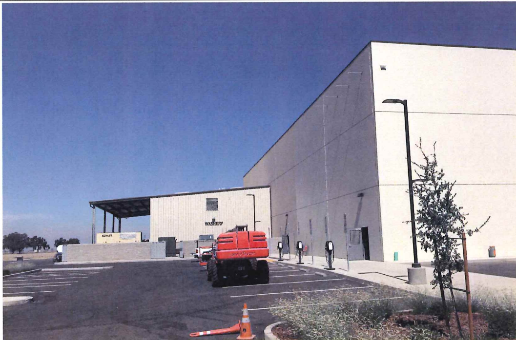
Photo Two Caption SOUTH SIDE/LOOKING NORTH (TAKEN 09/11/2018) (IMG_3722.JPG)