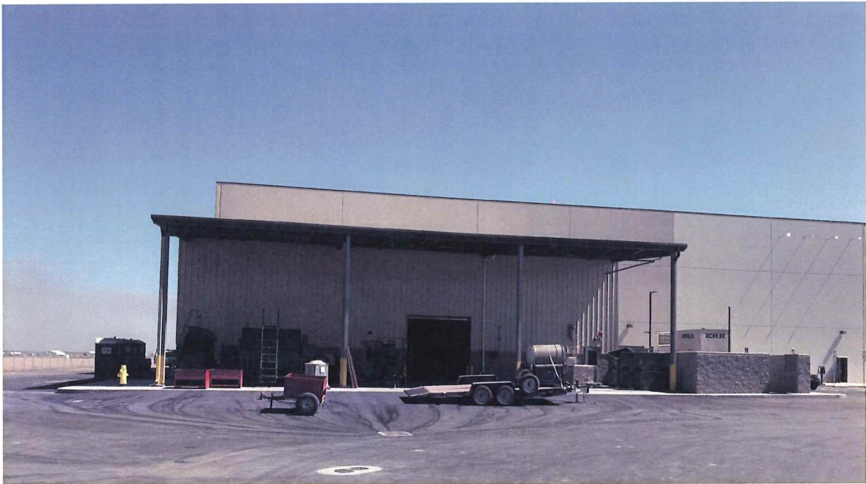
Photo One Caption WEST SIDE/LOOKING EAST (TAKEN 09/11/2018) (IMG_3732.JPG)

If using the Elevation Certificate to obtain NFIP flood insurance, affix at least 2 building photographs below according to the instructions for Item A6. Identify all photographs with date taken; "Front View" and "Rear View"; and, if required, "Right Side View" and "Left Side View." When applicable, photographs must show the foundation with representative examples of the flood openings or vents, as indicated in Section A8. If submitting more photographs than will fit on this page, use the Continuation Page.