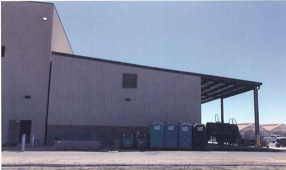
Photo One Caption NORTH SIDE/LOOKING SOUTH (TAKEN 09/11/2018) (IMG_3727.JPG)

If submitting more photographs than will fit on the preceding page, affix the additional photographs below. Identify all photographs with: date taken; "Front View" and "Rear View"; and, if required, "Right Side View" and "Left Side View." When applicable, photographs must show the foundation with representative examples of the flood openings or vents, as indicated in Section A8.