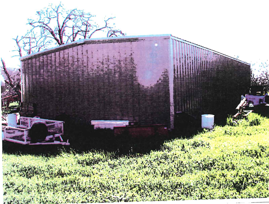
REAR VIEW 02/26/2009

If submitting more photographs than will fit on the preceding page, affix the additional photographs below. Identify all photographs with: date taken; "Front View" and "Rear View"; and, if required, "Right Side View" and "Left Side View."