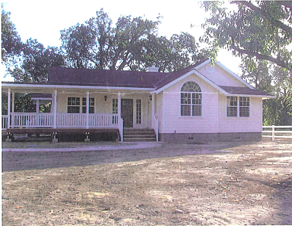
FRONT VIEW 08/28/06

If using the Elevation Certificate to obtain NFIP flood insurance, affix at least two building photographs below according to the instructions for Item A6. Identify all photographs with: date taken; "Front View" and "Rear View"; and, if required, "Right Side View" and "Left Side View." If submitting more photographs than will fit on this page, use the Continuation Page, following.