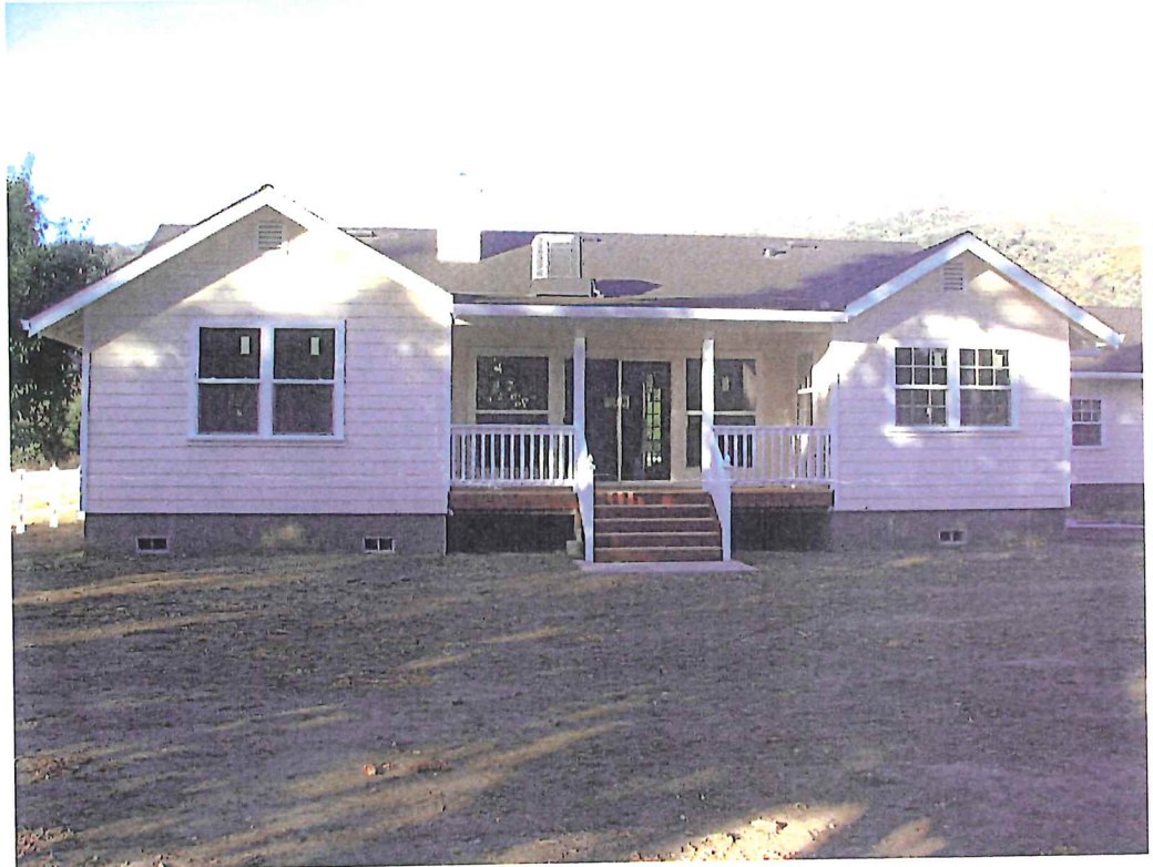
REAR VIEW 08/28/06

If submitting more photographs than will fit on the preceding page, affix the additional photographs below. Identify all photographs with: date taken; "Front View" and "Rear View"; and, if required, "Right Side View" and "Left Side View."