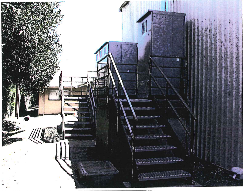
EASTERLY VIEW 04/28/2008

If using the Elevation Certificate to obtain NFIP flood insurance, affix at least two building photographs below according to the instructions for Item A6. Identify all photographs with: date taken; "Front View" and "Rear View"; and, if required, "Right Side View" and "Left Side View." If submitting more photographs than will fit on this page, use the Continuation Page, following.