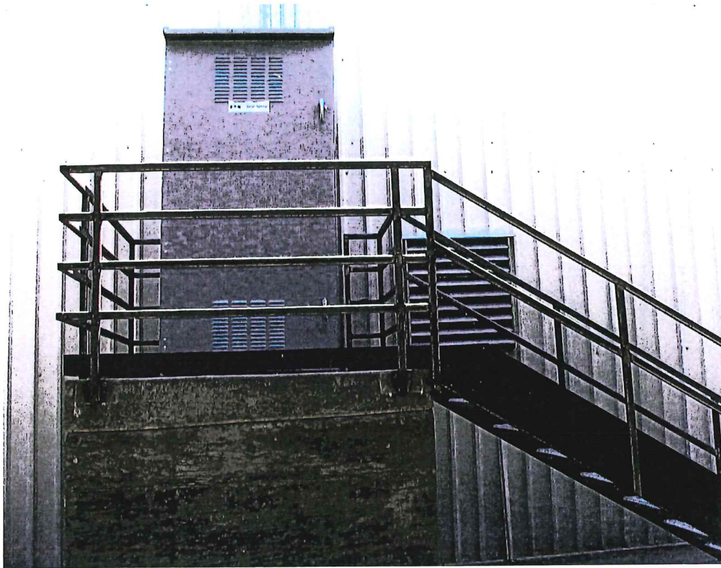
WESTERLY VIEW 04/28/2008

If submitting more photographs than will fit on the preceding page, affix the additional photographs below. Identify all photographs with: date taken; "Front View" and "Rear View"; and, if required, "Right Side View" and "Left Side View."