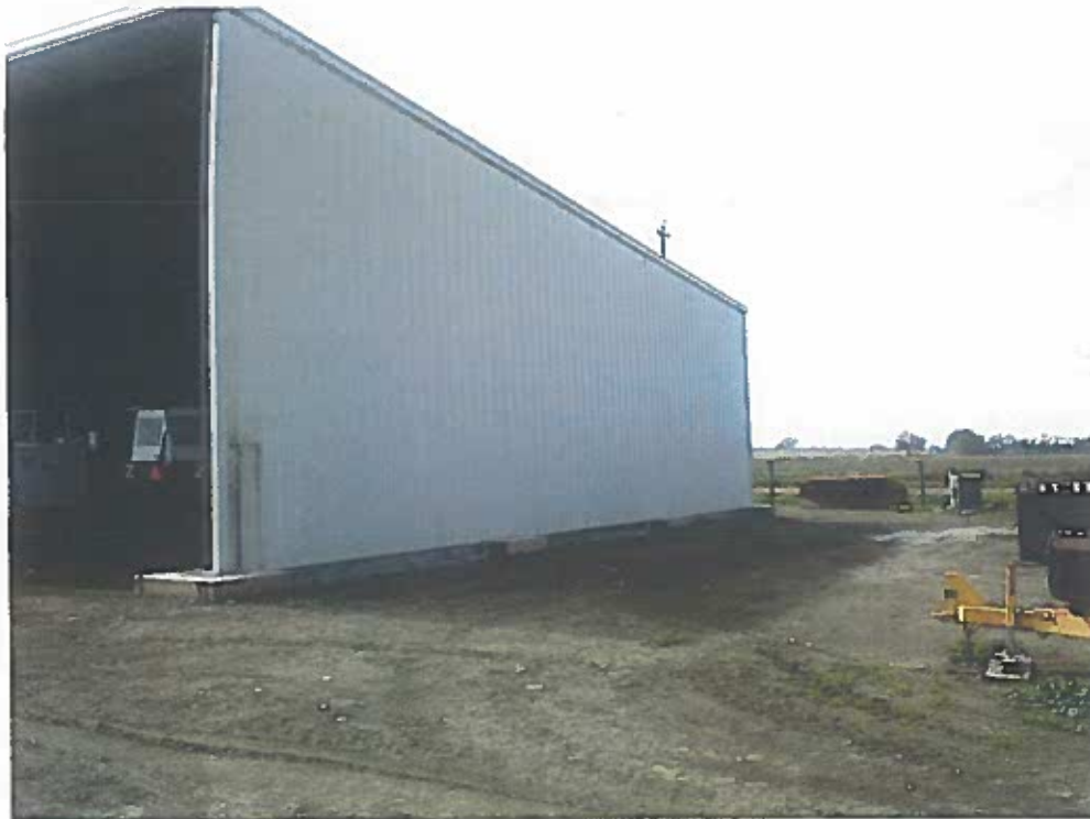
NORTH SIDE VIEW

If using the Elevation Certificate to obtain NFIP flood insurance, affix at least two building photographs below according to the instructions for Item A6. Identify all photographs with: date taken; "Front View" and "Rear View"; and, if required, "Right Side View" and "Left Side View." If submitting more photographs than will fit on this page, use the Continuation Page on the reverse.