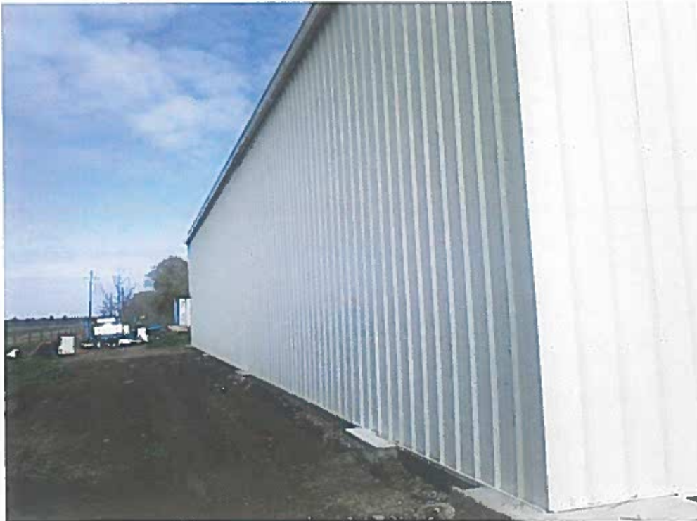
WEST SIDE VIEW

If submitting more photographs than will fit on the preceding page, affix the additional photographs below. Identify all photographs with: date taken; "Front View" and "Rear View"; and, if required, "Right Side View" and "Left Side View."