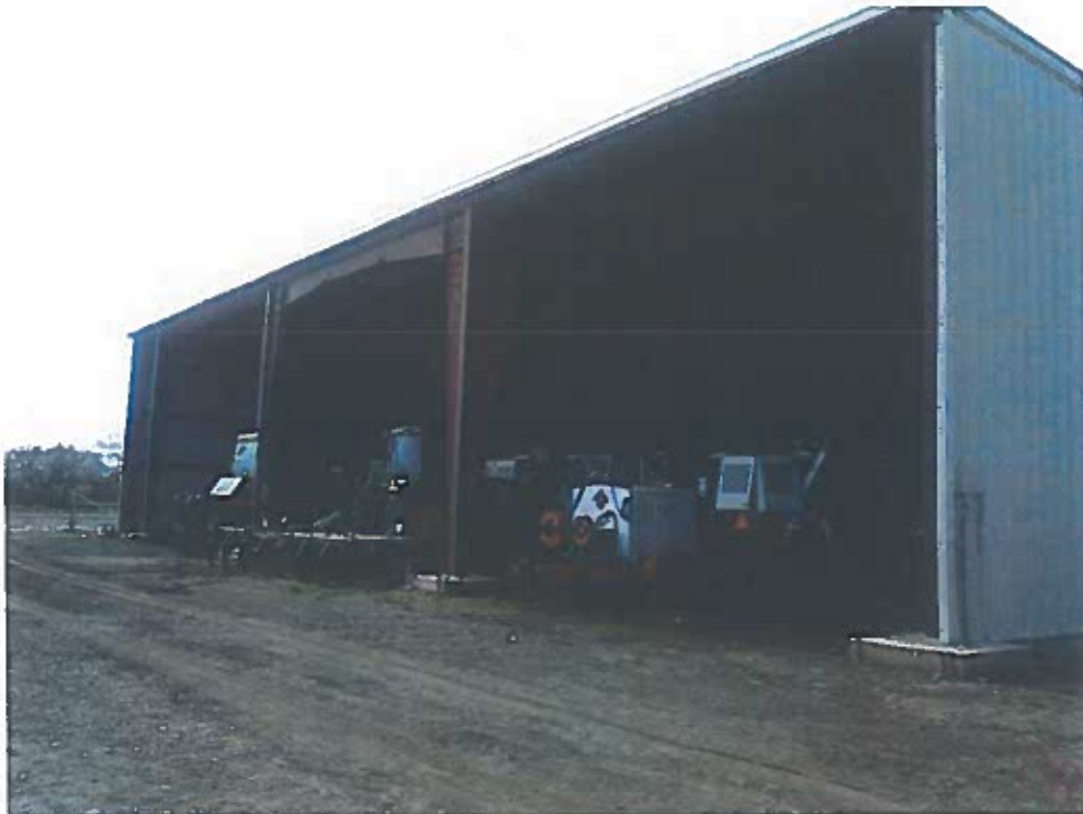
EAST SIDE VIEW

If submitting more photographs than will fit on the preceding page, affix the additional photographs below. Identify all photographs with: date taken; "Front View" and "Rear View"; and, if required, "Right Side View" and "Left Side View."