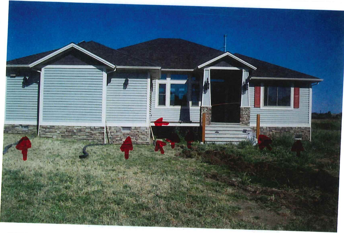
EAST FACE HOUSE (North area by Deck)