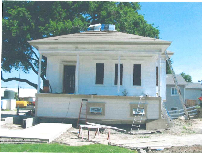
Looking north, May 5, 2010