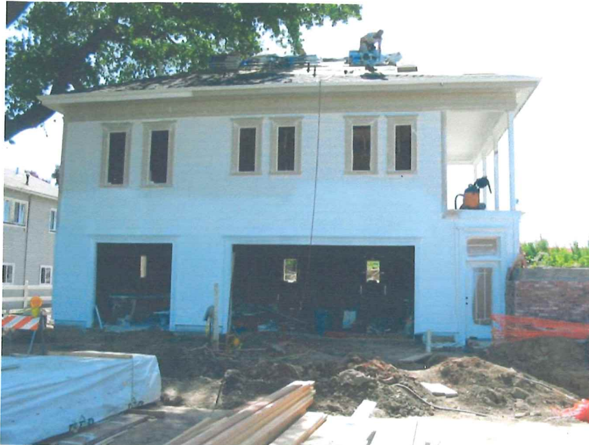
Looking east, May 5, 2010