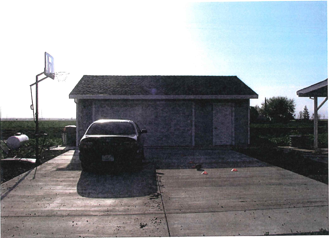
FRONT VIEW 04/25/06

If using the Elevation Certificate to obtain NFIP flood insurance, affix at least two building photographs below according to the instructions for Item A6. Identify all photographs with: date taken; "Front View" and "Rear View"; and, if required, "Right Side View" and "Left Side View." If submitting more photographs than will fit on this page, use the Continuation Page, following.