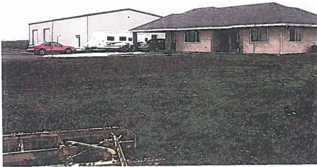
FRONT VIEW OF SHOP 01/09/2009

If using the Elevation Certificate to obtain NFIP flood insurance, affix at least two building photographs below according to the instructions for Item A6. Identify all photographs with: date taken; "Front View" and "Rear View"; and, if required, "Right Side View" and "Left Side View." If submitting more photographs than will fit on this page, use the Continuation Page, following.