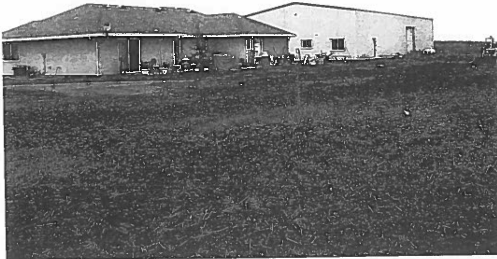
REAR VIEW OF SHOP 01/09/2009

If submitting more photographs than will fit on the preceding page, affix the additional photographs below. Identify all photographs with: date taken; "Front View" and "Rear View"; and, if required, "Right Side View" and "Left Side View."