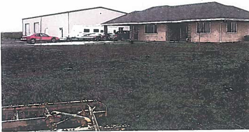
FRONT VIEW - HOUSE 01/09/2009

If using the Elevation Certificate to obtain NFIP flood insurance, affix at least two building photographs below according to the instructions for Item A6. Identify all photographs with: date taken; "Front View" and "Rear View"; and, if required, "Right Side View" and "Left Side View." If submitting more photographs than will fit on this page, use the Continuation Page, following.