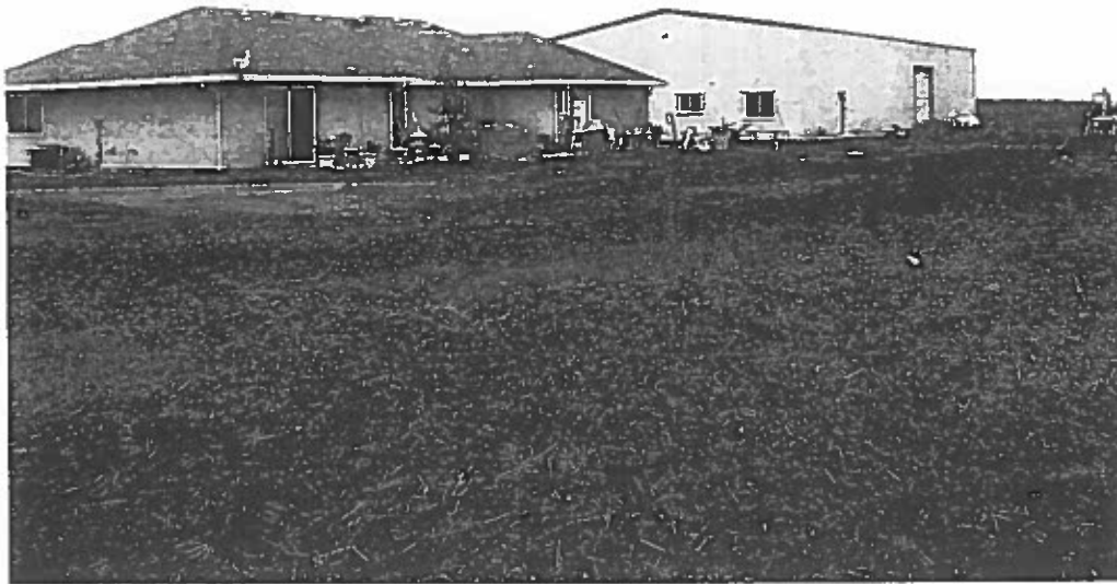
REAR VIEW - HOUSE 01/09/2009

If submitting more photographs than will fit on the preceding page, affix the additional photographs below. Identify all photographs with: date taken; "Front View" and "Rear View"; and, if required, "Right Side View" and "Left Side View."