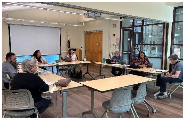
Winters Community Aging Caregivers Townhall

While much work has been done over the years on issues related to aging there has been a renewed focus on the similar and additional needs of persons with disabilities. The commission received public comment, followed by a presentation in February of 2022 from a local mother of a person with an intellectual disability. The comment and presentation highlighted the need to address both the challenges faced by aging caregivers of persons with I/DD and the need for affordable, supportive housing for persons with I/DD. The presentation led to the appointment of an Ad Hoc Committee to receive community input through a series of virtual and in-person meetings throughout Yolo County to hear about the needs of both caregivers, and those living with I/DD. This report summarizes the work of this Ad Hoc Committee and provides recommendations for actions to address these needs.